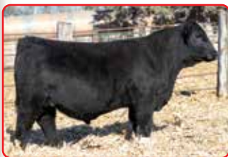
Rockin H Mr. Loverboy L70, Son of D07 selling as Lot 70