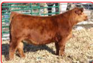
Rockin H Ms.Fakota F37, Daughter of D07