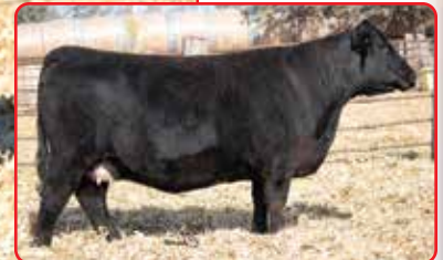
Rockin H Ms. Carolina Dam of Lots 1-3