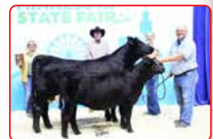
Bea State Fair