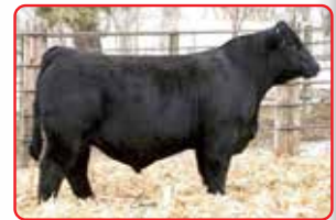
Shay x Quantum Leap black son