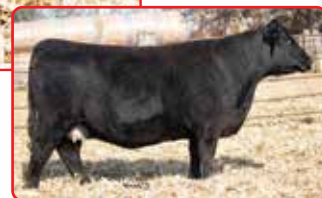
Rockin H Ms. Carolina Dam

Rockin H Ms. Carolina is natural calf and the youngest bull in the offering this year. He performed really well at weaning time ranking first in his group and rounding out in the top five at yearling weight time. Ranking in the top 2% for weaning and top 5% at yearling weight EPDs. Cut from the same mold and factory as his extremely popular maternal brother Rockin H Captivate.