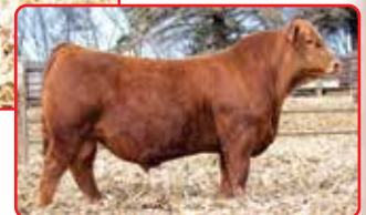
Rockin H Captivate J75, Full Sib to Lots 44-46 and Sire to Lot 47

THSF Lover Boy B33 Rockin H Captivate J75 Rockin H Ms. Carolina CDI Authority 77X Rockin H Ms. Authority GS Lanaks Scarlet Dream