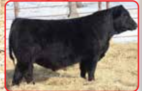
W/C Rest Easy 752G, Sire