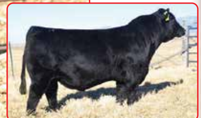
THSF Lover Boy B33, Sire of Lots 1-3