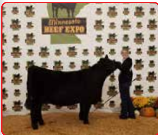
Rockin H Ms.Dakota D07 Dam of Embryos

THSF Lover Boy B33 Rockin H Captivate J75 Rockin H Ms.Carolina W/C Fort Knox 609F SC Robins Kiss J6 SC Robins Kiss D27