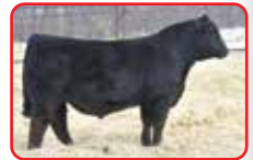
LCDR Favor 149F, Sire

LCDR Witness 541C LCDR Favor 149F WS Miss Sugar C4 J Bar J Nightride 225Z Rockin H Ms.Eliza E55 Rockin H Ms.Clubqueen