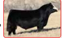
LLW Card True North