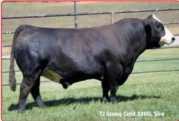
TJ Stone Cold 336G, Sire

Stone Cold son, potential calving ease bull with a birth weight at 77 pounds.