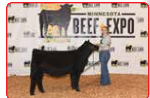
Bea as a natural calf