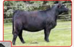
HS Glamour Baby G38C, Dam Lots 50 & 50A

Est PM EPDs: 12 2.0 85 135 .31 6 22 64 15 14.5 Carcass: 29.4 -.45 .16 -.09 .95 135 83 HS Glamour Baby or AKA G Baby was purchased from Hilbrands Simmentals off the Jewels of the Northland Sale. When we first saw G Baby, we knew she would fit in well here with our operation. She is built with so much rib dimension and mass, heavy bone big wide topped and super cool easy moving. Sired by the great Mr CCF 20-20, that has left a huge impact on the Simmental breed along with her maternal grandam Burn Baby Burn. We will guarantee 1 successful 60-day pregnancy if the embryo work is performed by a certified embryologist.