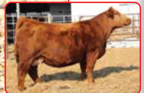
HILB/MBCC Princess Merinda, Dam