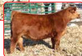
Rockin H Ms.Fakota F37

A super attractive, stylish Rockin H Heisman son that has a killer look to him. He is super clean, cool fronted and bold in his rib... a red calving ease option. His dam was a sale feature a few years back we sold part interest in to Nemitz Cattle Company.