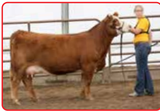
HILB/SHER Loaded Beauty 773E, Dam Lot 51

Est PM EPDs: 14 .7 75 107 .20 6 17 54 9 7.9 Carcass: 23.2 -.52 -.01 -.11 .97 112 74 Loaded Beauty AKA "Shay" at our place ran a successful show career for 2 1/2 years before we retired her and let her live her life in the pasture with the others. She was a MN State Fair "Triple Crown" winner in the 4-H, Open Class, and FFA Simmental cow/calf shows as well as 4th overall pair at Jr. Regionals in Fargo ND. Shay had a natural calf sired by Quantum Leap in 2020 that sold in this sale in 2021. He was deep sided, awesome fronted, and massive hipped with so much muscle definition. We loved him so much we decided to flush her to Quantum Leap to see if we could get a few more bulls like her natural one and to see what a heifer could be. We haven't had the chance to use any of these embryos yet so take this opportunity while you can. This may be the only time to get your hands on this mating! Let this proven mating do the work for you and hopefully have the same success that we did. We are offering up 3 Conventional Embryos from this mating. We will guarantee 1 successful 60-day pregnancy if the embryo work is performed by a certified embryologist.