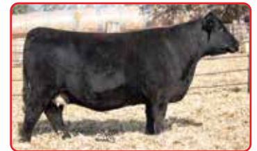
Rockin H Ms. Carolina, Dam of Lots 44-46 and Grandam of Lot 47

Rockin H Ms. LoverGirl L35 is the longest, stoutest made of the three sisters. She has a world of potential and a bright future of production ahead of her. The type of a female that can produce high end bulls and replacement heifers. Rockin H would like to reserve the right of 1 flush on this female at the buyer's convenience and at the seller's expense.