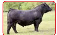
KRJ Dakota Outlaw, Sire

Rubys Turnpike 771E KRJ Dakota Outlaw G974 BRKC Daphne DY37 Ellingson Legacy M229 LHT Ms Olie 233Y LHT Ms Worth 277W