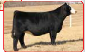
SC Robins Kiss J6, Dam

Real fancy blaze face Captivate daughter out of my son's show heifer. We purchased SC Robins Kiss from Shoal Creek. Liberty's grandam, SC Robins Kiss, is a mainstay donor for Shoal Creek in MO, producing many sale toppers and showing champions over the years. Liberty is broke to tie and would make a great beginner show project and an awesome cow when her show career is over.