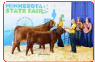
Shay State Fair as a pair